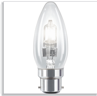
B22, B35, Clear